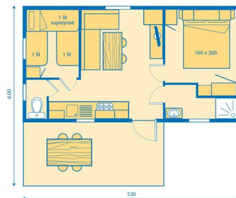
Mobile home AZUR